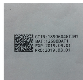
GS1 Data Matrix