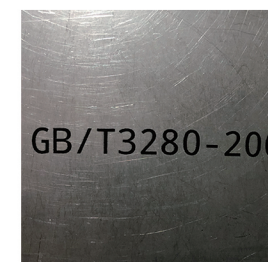
HD bold font