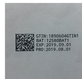
GS1 Data Matrix