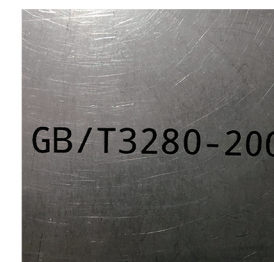
HD bold font