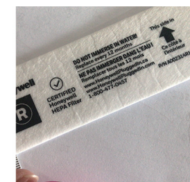
Multi- group printing