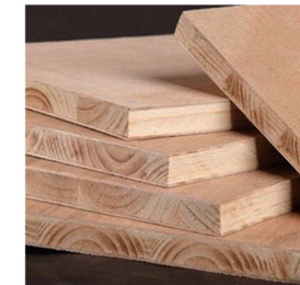
Furniture and wood