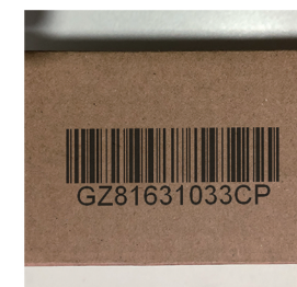
Dynamic security barcode