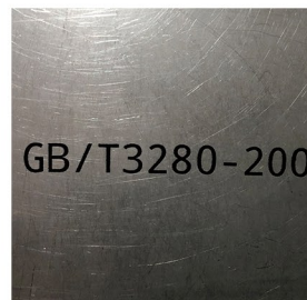
HD bold font