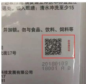
Dynamic trace QR code