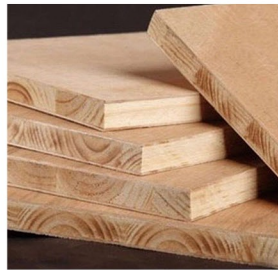
Furniture and wood