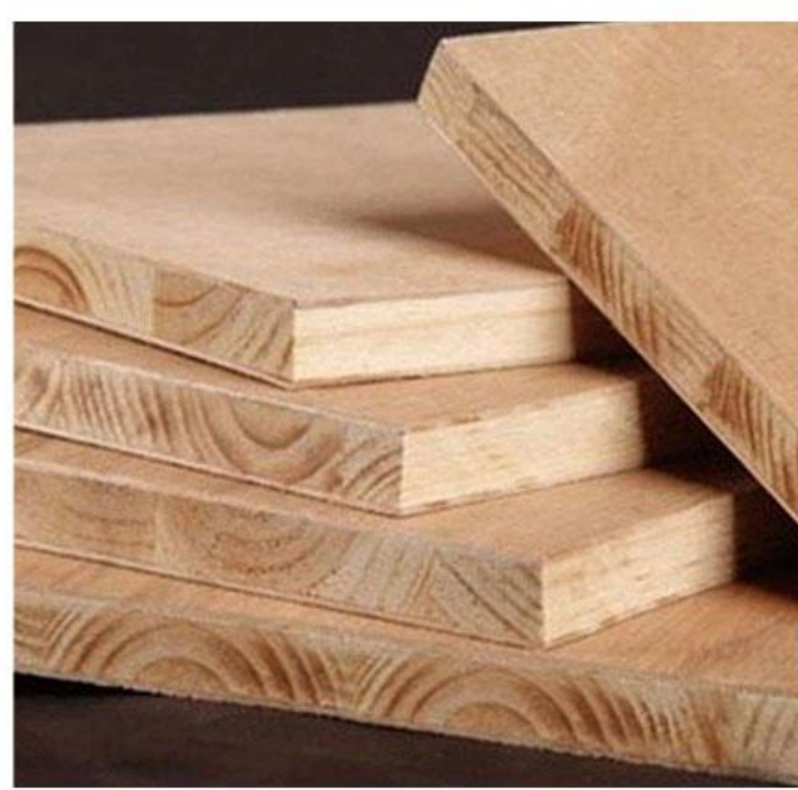
Furniture and wood