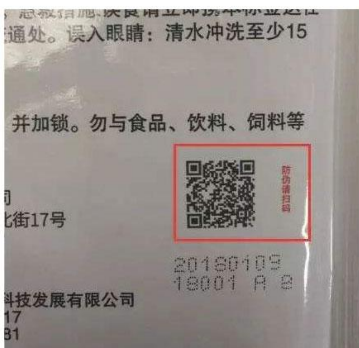
Dynamic trace QR code