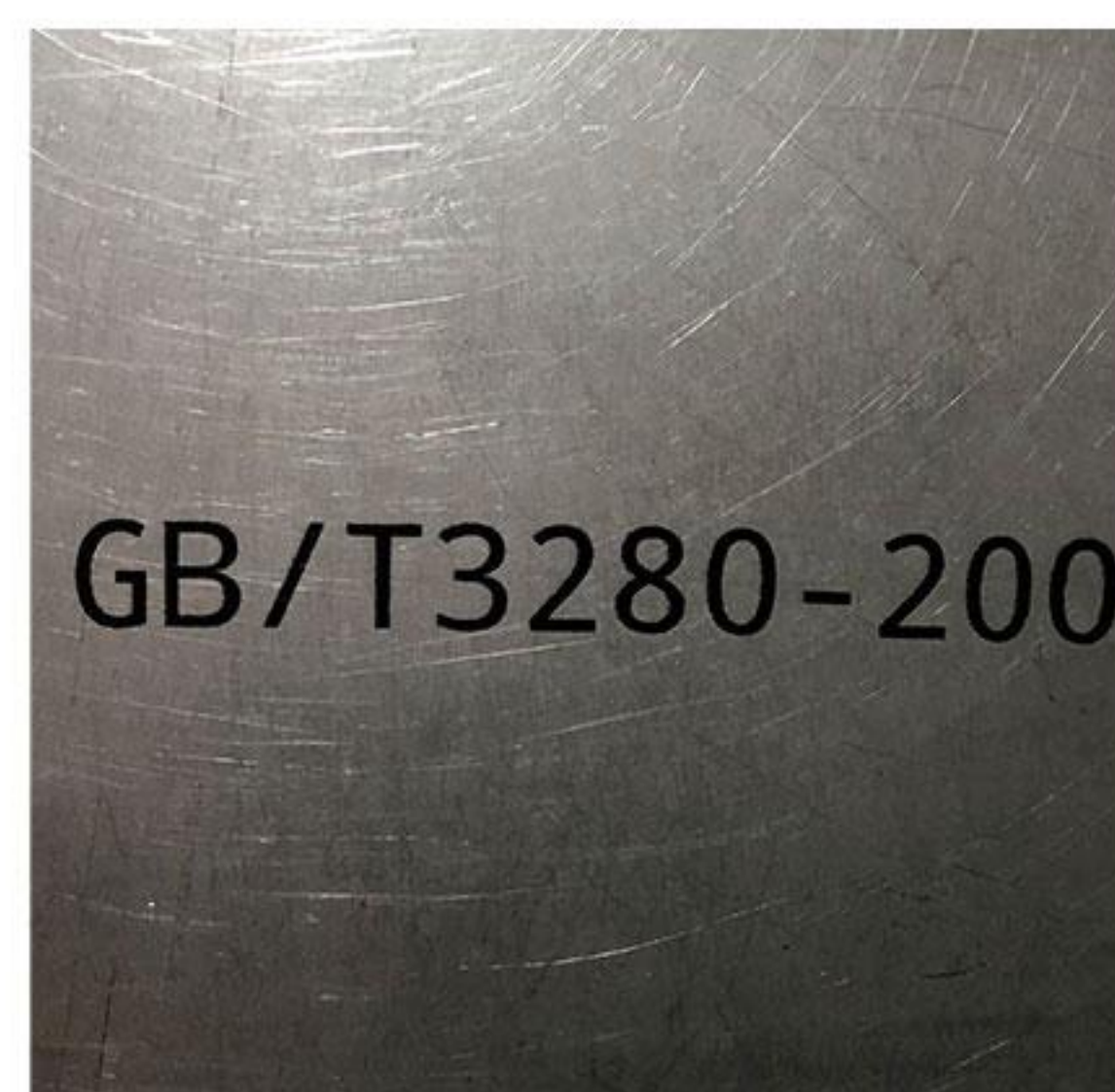
HD bold font