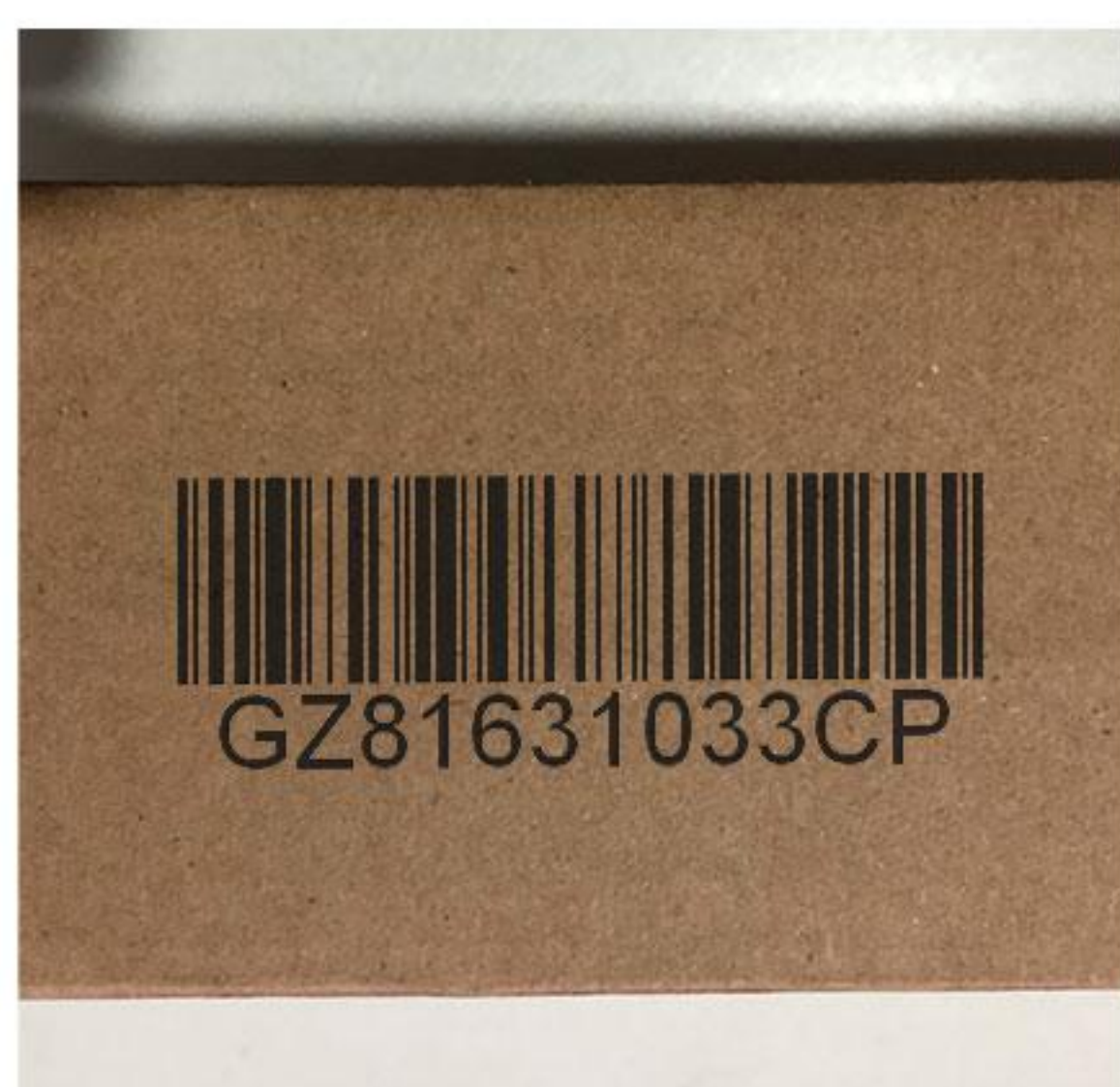
Dynamic security lable